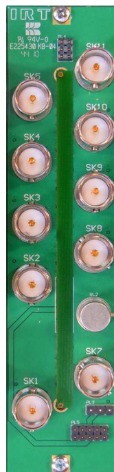
Relay Bypass Rear Assembly