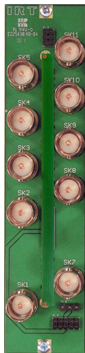
Standard Rear Assembly